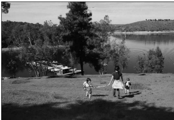
Enjoying the "million-dollar" views at Lake Jennings.

A Lake Jennings Sanitary Survey was updated in February 2011. The purpose of such surveys is to assess the watershed to determine the existence and potential hazards of contamination sources that could reach the public water supply. The water quality of Lake Jennings is considered vulnerable to: wastewater, recreation, development,