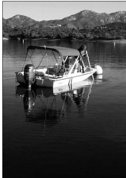
Lake Jennings reservoir helps the District store, treat, and deliver water to more than 260,000 people in La Mesa, El Cajon, Lemon Grove, and parts of Spring Valley and Lakeside.

As always, we welcome public participation and comments on the Lake Jennings Sanitary Survey Update during our regularly scheduled Board Meetings. You may request a summary of the assessment by contacting Helix's senior chemist at (619) 667-6248.