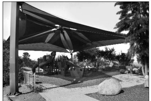
Lake Jennings Campground has a children's play area.

24-Hour Water Emergencies (619) 466-3234