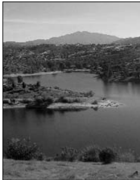
Lake Jennings is the District's reservoir. It has a 9,790 acre-foot capacity.

Additional copies may be obtained by calling (619) 443-1031. If you have any questions or concerns regarding this Water Quality Report, please contact Helix's senior chemist at (619) 667-6248.