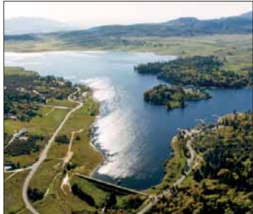
Lake Cuyamaca Reservoir and recreation area.

Helix Water District is a charter member of the Water Conservation Garden at Cuyumaca College, which demonstrates low-water-use landscaping that is well-suited for San Diego's semi-arid climate.