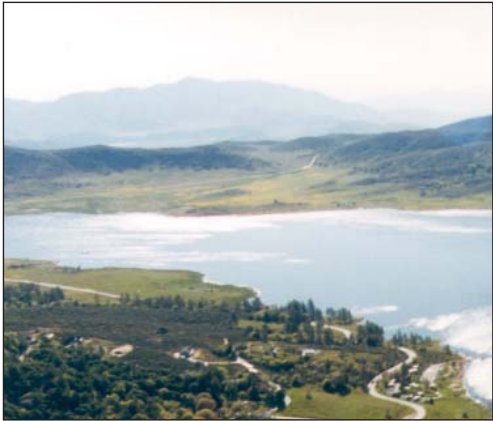
Lake Cuyamaca Reservoir and recreation area.

Today, the District is a progressive industry leader. We continue to provide high quality water through an efficient and reliable system. Our 146 innovative and dedicated employees and five board members maximize human and technological resources, providing superior service to our customers.